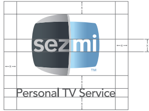
logo with functional descriptor clear space